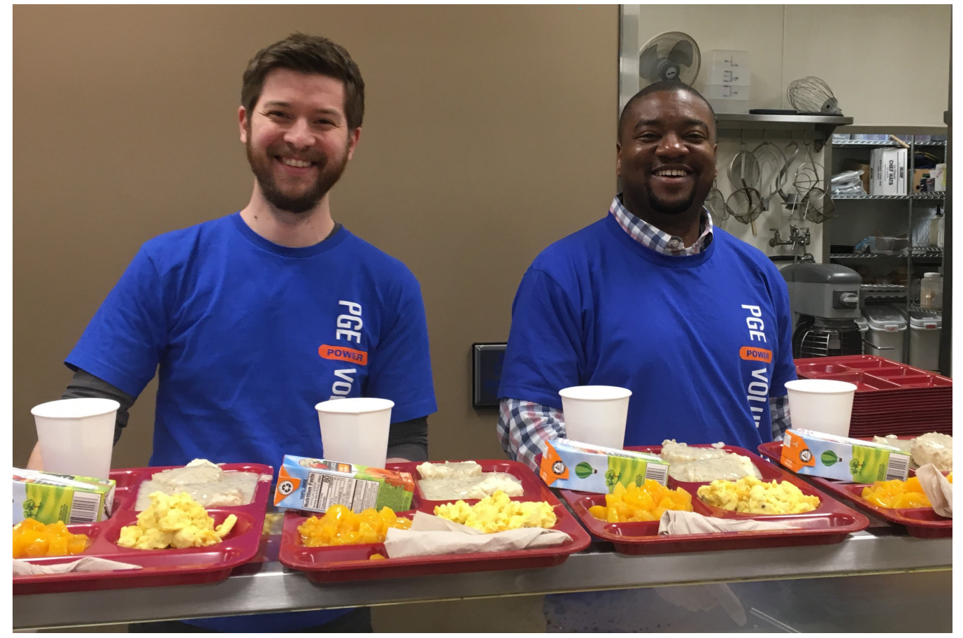
Prior to COVID-19 requirements.

PGE realizes it's not enough to focus on our workforce. Our vision is to deliver an equitable energy future for all. This means that we apply an equity lens to all aspects of our business, collaborate with our communities — particularly those that have been historically underserved — and prioritize their voices to inform our decisions. We also partner with others to break through economic, cultural, and language barriers so all customers — regardless of income, background, ethnicity, or physical location — can benefit from the evolving way energy is generated and delivered.