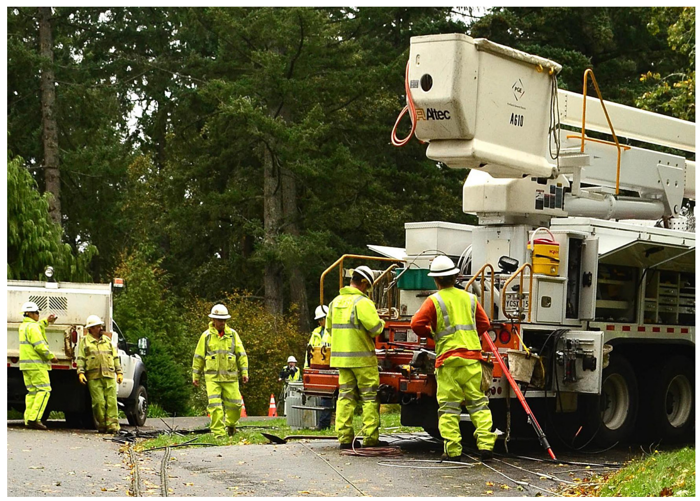
Prior to COVID-19 requirements.

A No. While you can generally accept appropriate gifts that have a value of less than $200 without getting approval, it's never okay to accept a gift, meal, or entertainment of any value from someone who is currently bidding on PGE work or in contract negotiations with PGE.