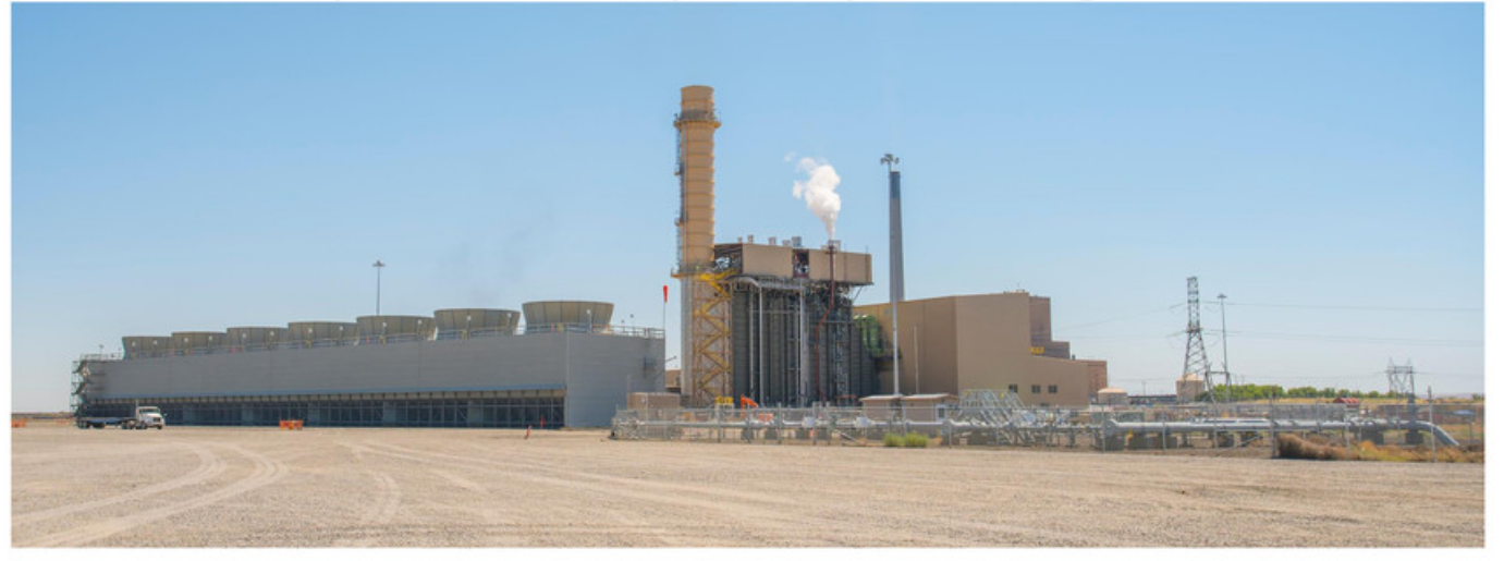
Carty Generating Station, our 440 MW natural gas baseload plant near Boardman, OR